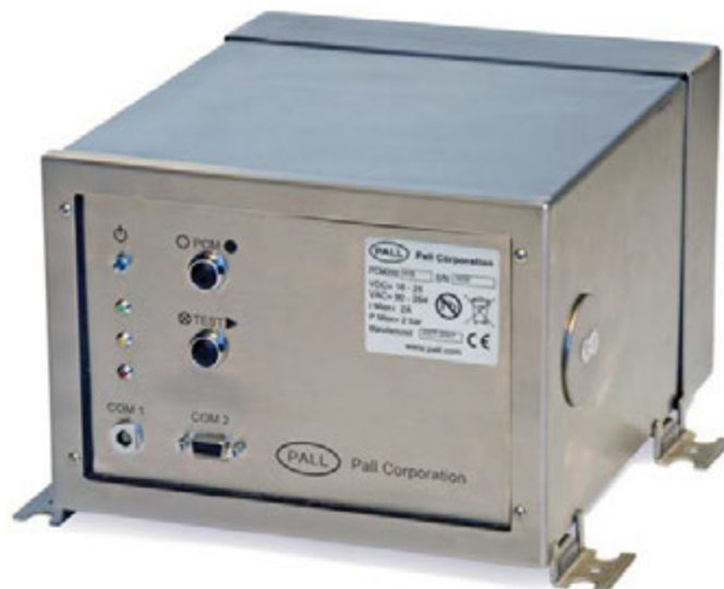
Pall PCM200 series Fluid Cleanliness Monitor