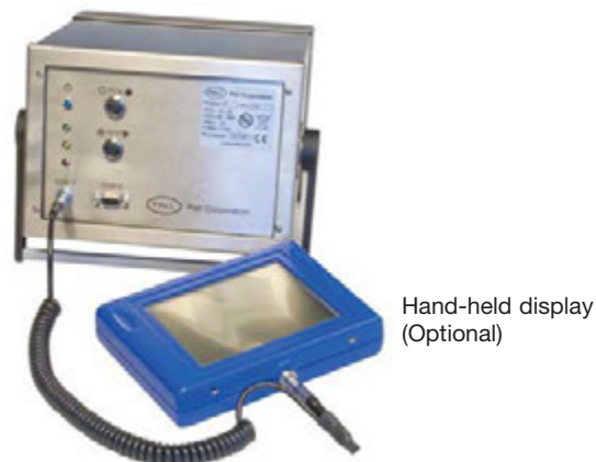
Hand-held display (Optional)

The optional 'hand-held' display shows real-time data and test results, which are automatically stored for subsequent trending and evaluation. Data can also be displayed on a remote PC or PLC using simple ASCII II commands.